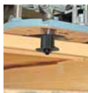
Routing with the router (optional)