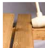
Add the next boardsuivante