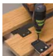
Fasten to the boards with screws