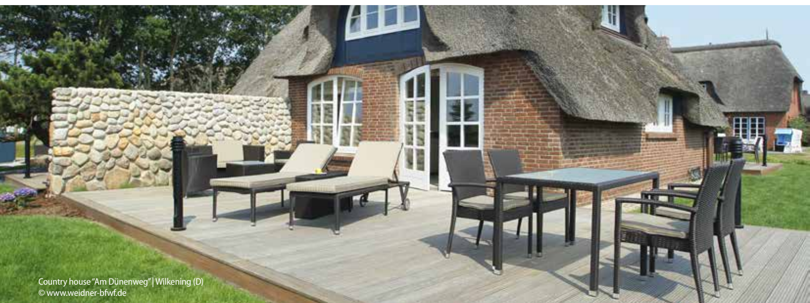
Country house "Am Dünenweg" | Wilkening (D)