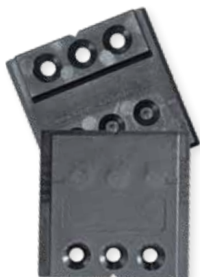
Quatro 65/25 Art.-No. Ko81

Recommended for spacing no smaller than 7 mm