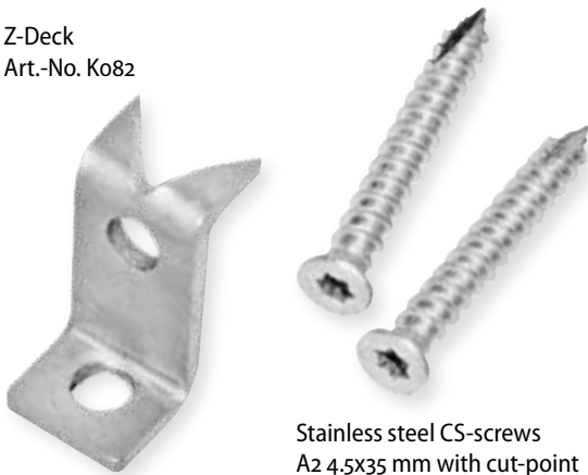
Stainless steel CS-screws A2 4.5x35 mm with cut-point