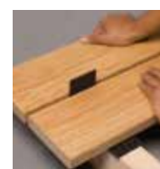
QUATRO 65 as a spacer