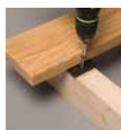
Fasten to the joists with screws