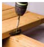
Fastening with screws