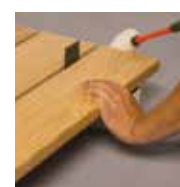
Mount the final board