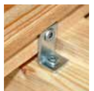
The Z-DECK is completely mounted